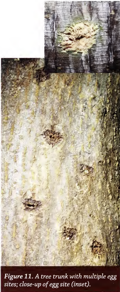
Figure 11. A tree trunk with multiple egg sites; close-up of egg site (inset).

are perfectly round and about three-eighths of an inch in diameter. Developing larvae often push material called frass out onto the ground or onto tree branches as they tunnel about inside an infested tree. ALB-attacked trees also display small, roundish pockmarks in the bark on trunks or branches. These marks show where an adult female has chewed a depression to lay an egg. ALB-infested trees may